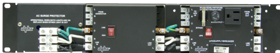
Universal Automatic Transfer Switch (UATS-far right) and Universal Generator Transfer Switch (UGTS-center) shown with surge protection (TVSS-left) in a 19" rack mount bracket (23" rack mount bracket also available).